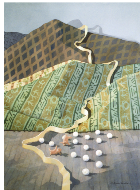
Casting Among Pearls , watercolor, image size 30" x 22", © Ellen Fountain

For this simple exercise in using stencils, you will need a piece of stencil paper, wax paper or a piece of clear mylar or plastic (I use clear plastic file folders available at an office supply store). You will also need a small sheet of watercolor paper, and an old toothbrush.